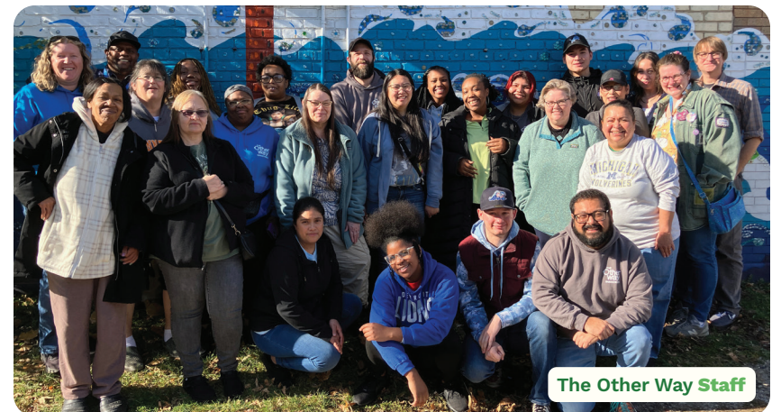
The Other Way Staff