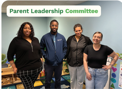
Parent Leadership Committee

Our Parent Leadership Committee (PLC) is made up of at least four parents who have children currently enrolled at Little Lights and actively attend. We meet every other month and offer childcare, dinner, and a stipend. The meetings are a safe space where parents are empowered to be more active and involved in their children's early education and care. Parents can offer feedback, support, and advocate for change. PLC exists so parents can have a voice, so they are committed and empowered, and so Little Lights is the very best it can be.