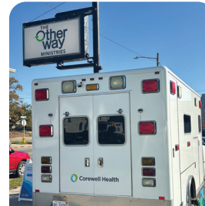
Added Corewell Street Medicine as a service in late 2025

50 program days total in the year 1,473 meals served by The Other Way 268 housing assessments completed by Mel Trotter 1,618 total attendance not all unique individuals 568 showers supplied by Mel Trotter trailer 34 eye exams with Clear Sky Eyecare partnership